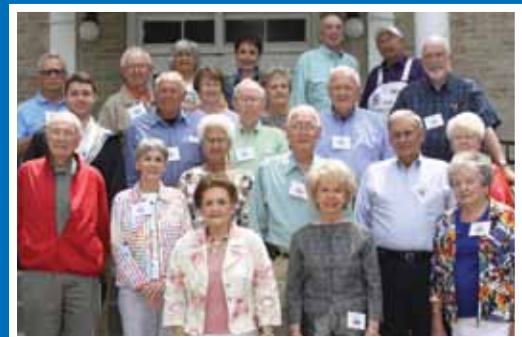
Attendees gather on the steps of the Clower Center where many attended basketball games and took physical education classes.